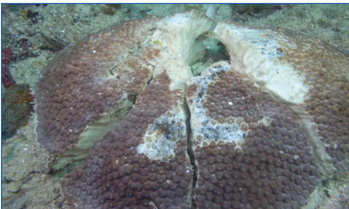
Montastraea cavernosa coral damage from anchor chain in Florida.

Report anchor damage to Southeast Florida Action Network (SEAFAN) online or call 866-770-7335.